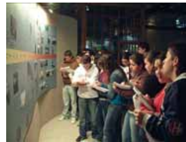
Local students visiting the centre soon after its opening