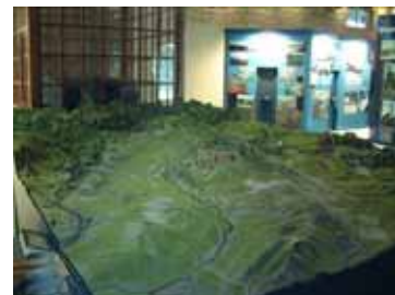
State of the art laser operated model of the Linares-La Carolina Mining District