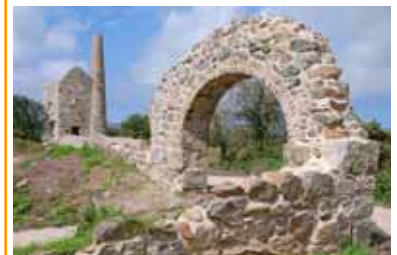
Above: The reconstructed pumping engine boiler house arch and 36 inch stamps engine house.