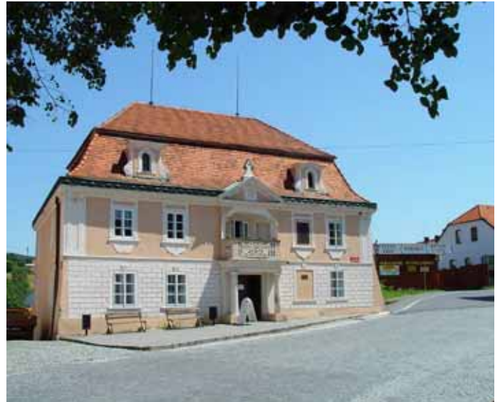
Top: Chamber in the Malesov Skarn Mine; Bottom: Nový Knín Gold Museum